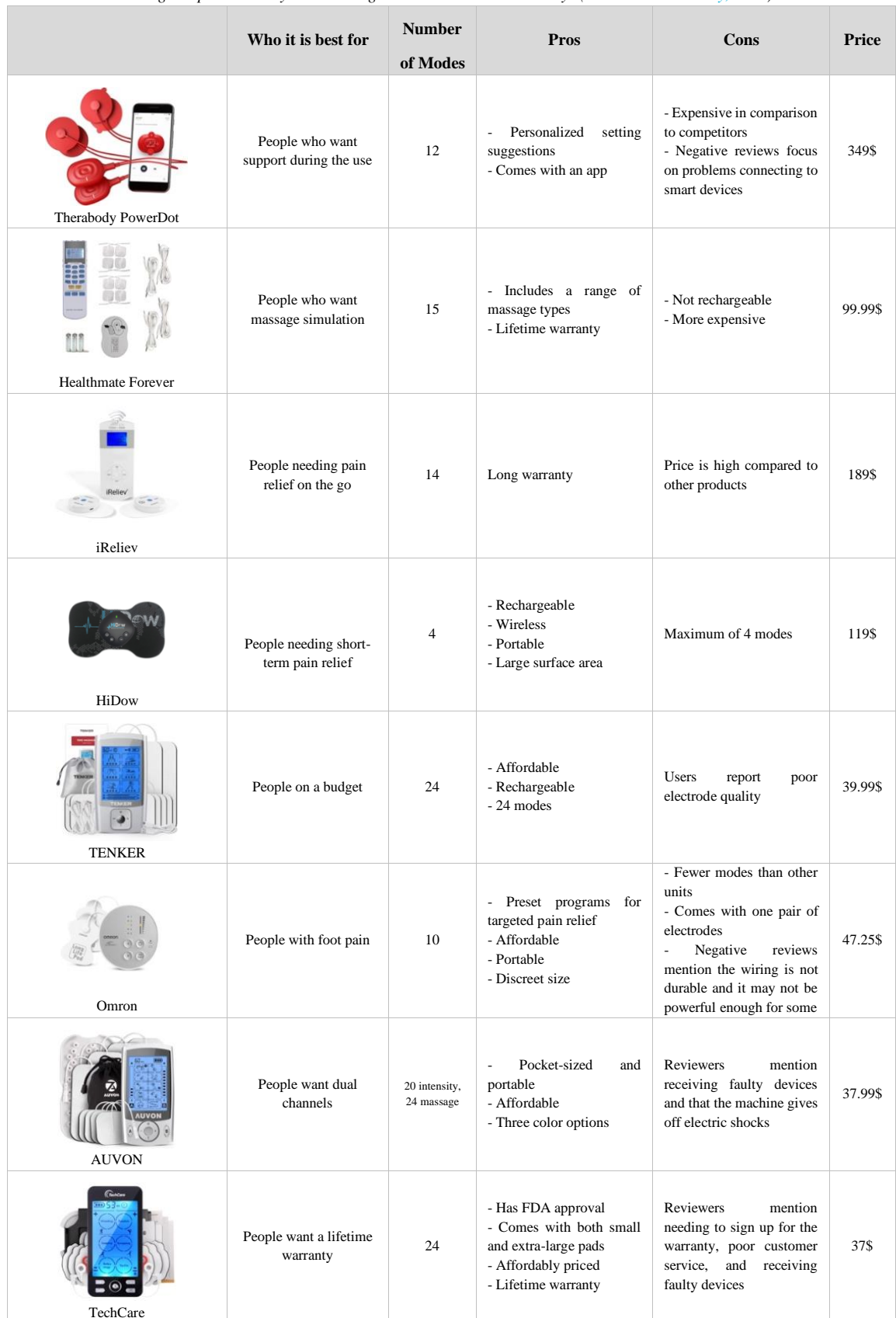
Table 1: Benchmarking competitive analysis according to the "Medical News Today" ( Medical News Today, 2023 ).